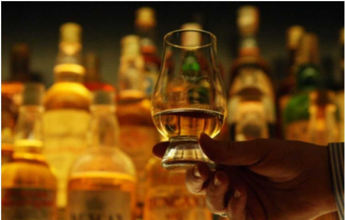
SWA says it has “robust marketing code” in place.

Industry umbrella body, the Scotch Whisky Association (SWA) added it “shared many of the same goals” as Holyrood and protecting children from harmful advertising, but insisted it had “deep concerns” regarding such potentially far-reaching moves.