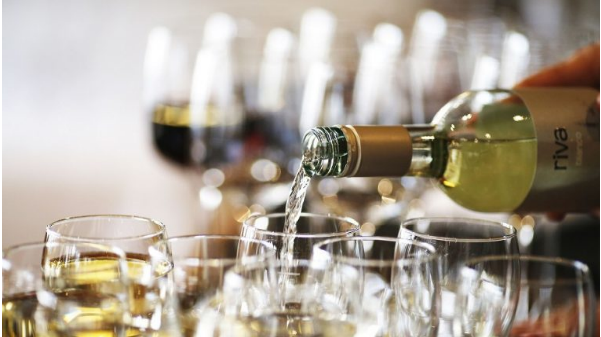
Would measures curb Scottish alcohol consumption?

slamming the ideas as “damaging” and having a significant knock-on effect for suppliers.