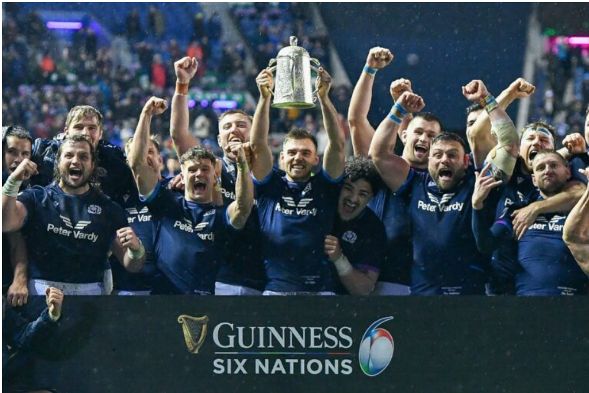
Could alcohol advertising disappear from Scottish sports events?

The consultation document cites Estonia cracking down hard on TV adverts and restricting content promotion.