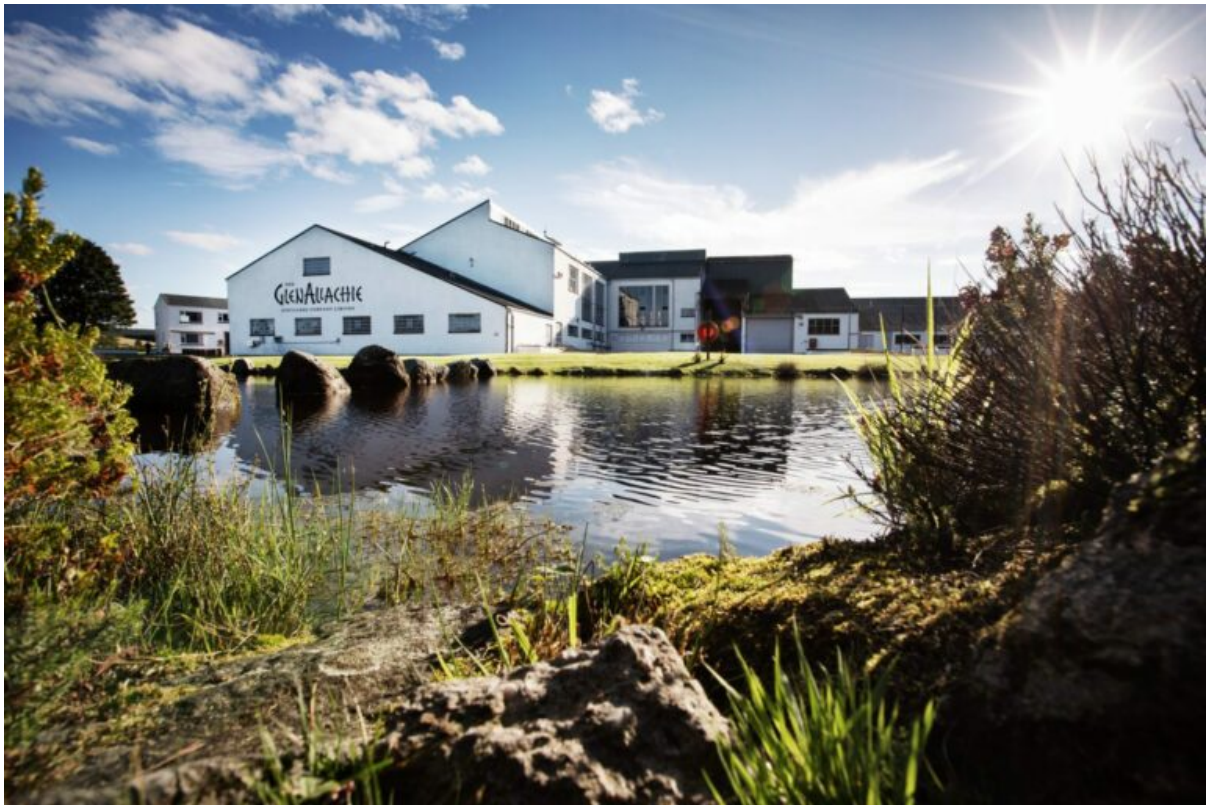
The GlenAllachie offers many tours of its operation.

It is as yet unclear what effect the government's proposals could have on those tours or whether merchandising would have to drastically change to comply with any new regulations, but the industry as a whole is now holding its breath to see what the consultation paper comes back with.