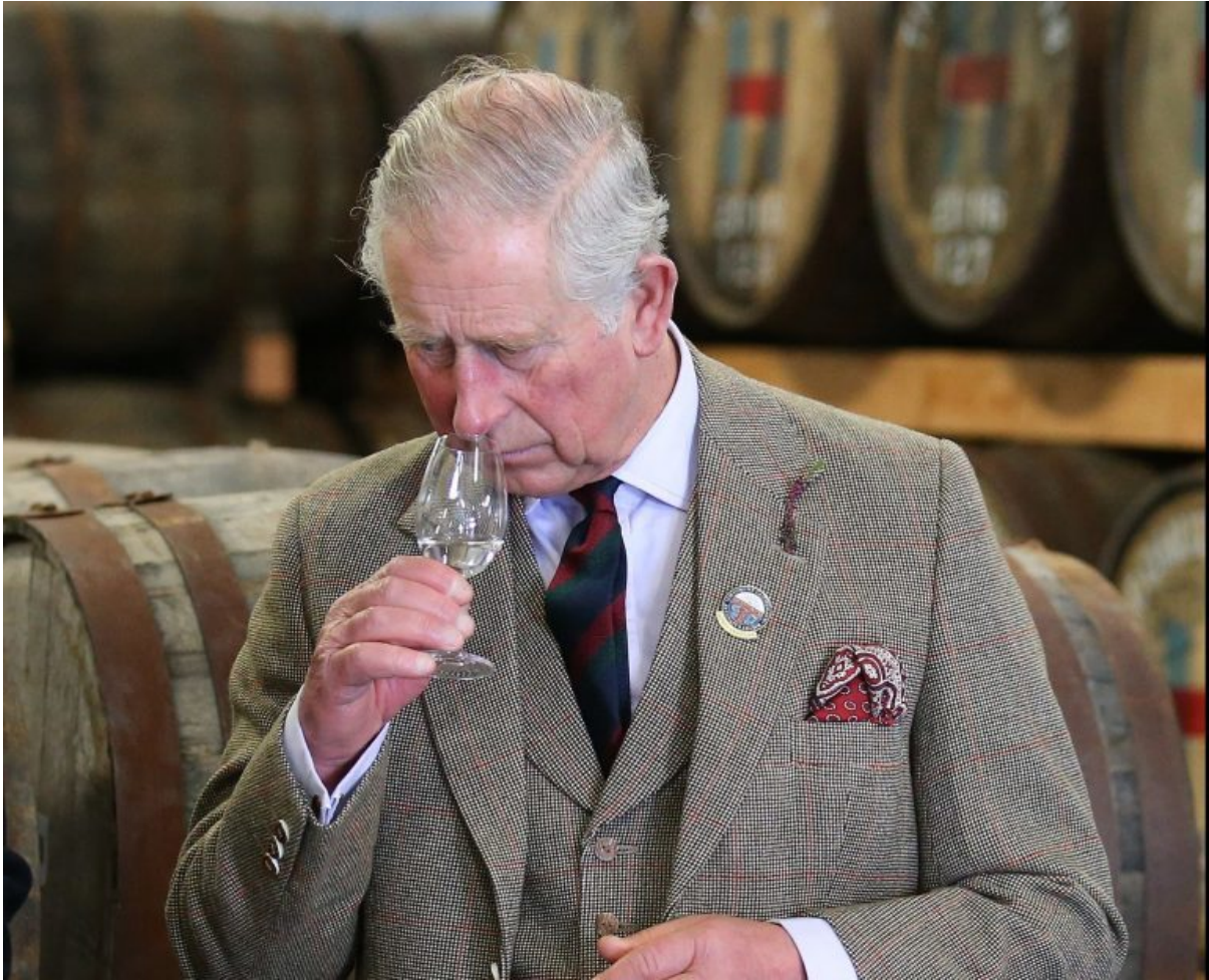
The then Prince of Wales visited Isle of Harris Distillery.

“HSBC UK has supported us in our ambitions to grow our business. Achieving ongoing commercial success stimulates global interest and visitors to this beautiful island, assisting it to survive and flourish in the 21st century.”