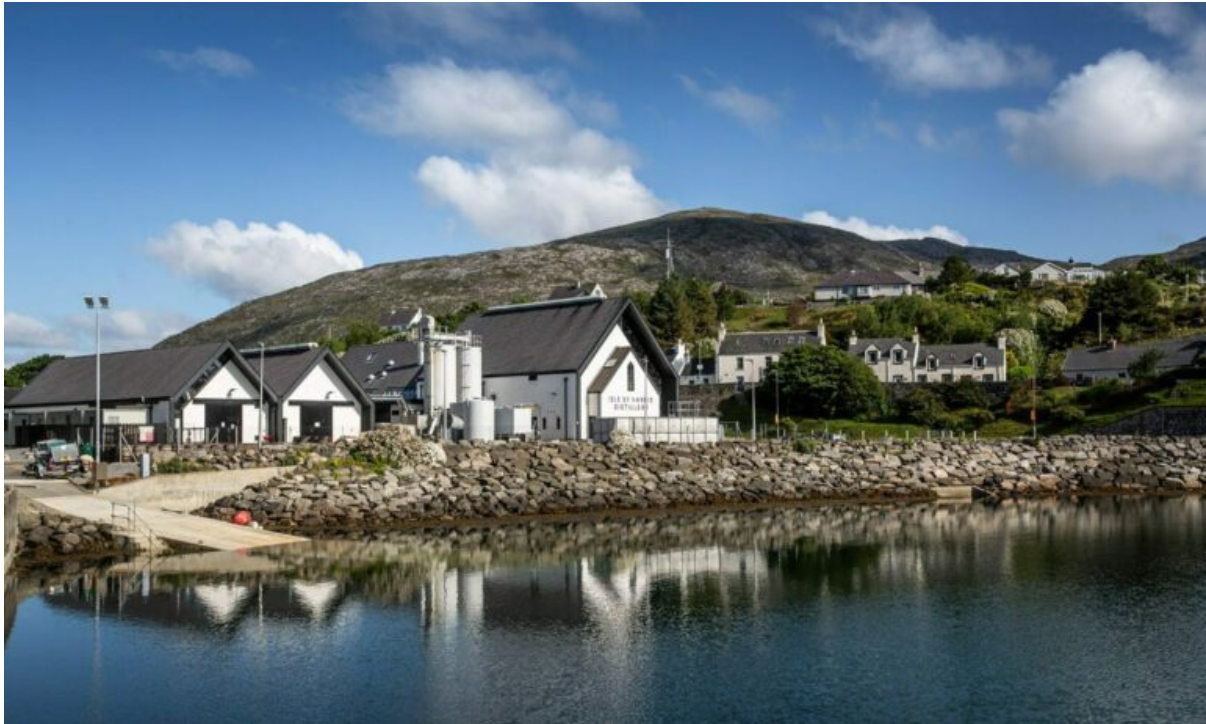
Isle of Harris Distillery is looking to expand to 20 overseas markets.

By Simon Warburton ⌚ December 20, 2022, 5:48 pm 0