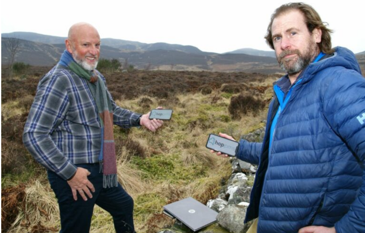
Deals now around the world.