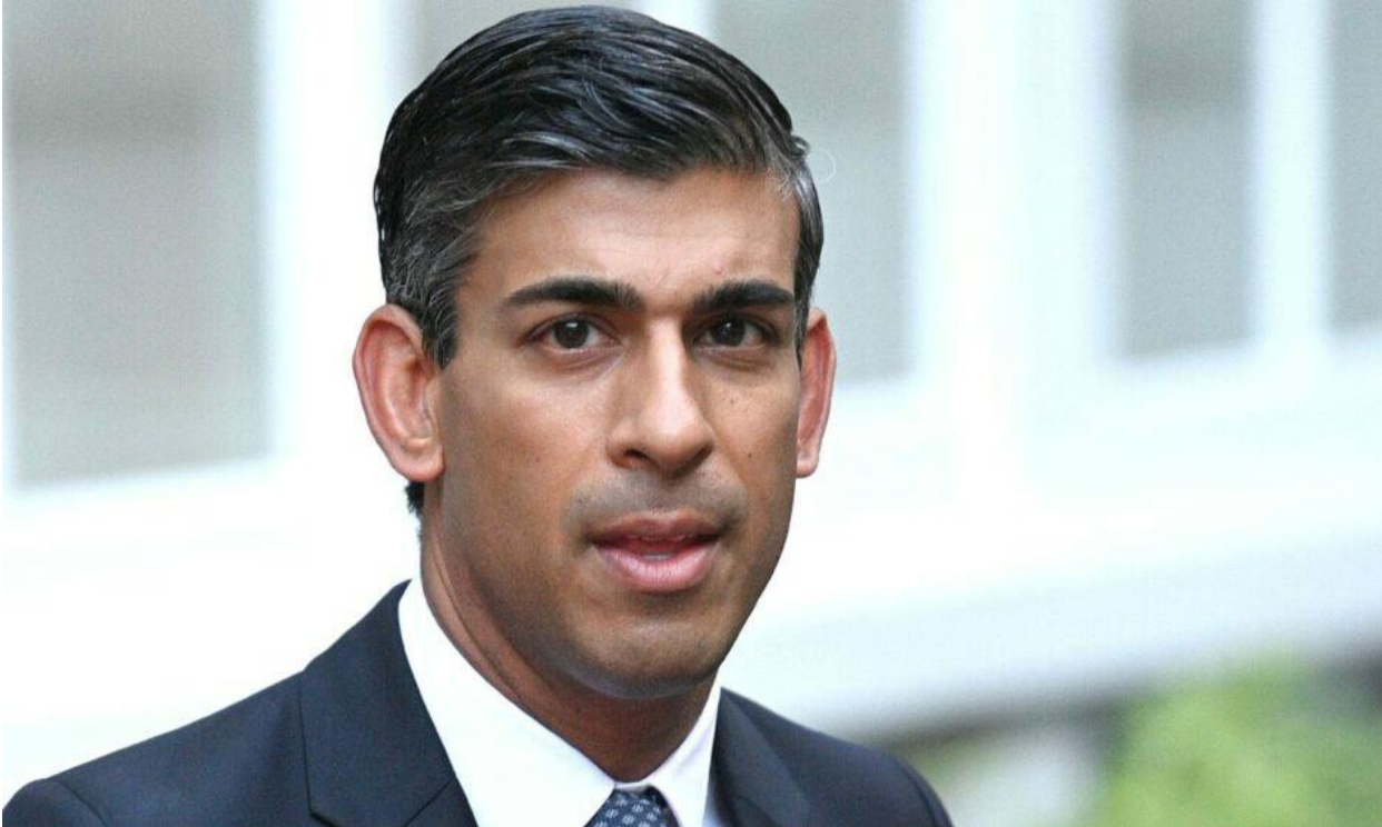
Prime Minister Rishi Sunak was in Cromarty Firth as the green freeport awards were unveiled.

incentives for areas around airports, seaports and rail terminals.