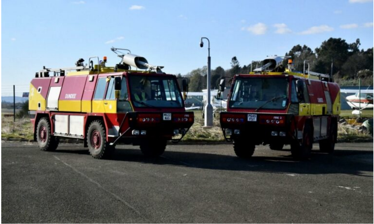
Airports cannot operate without adequate fire crews.

from postal deliveries, to offshore workers not being able to reach rigs or return home.