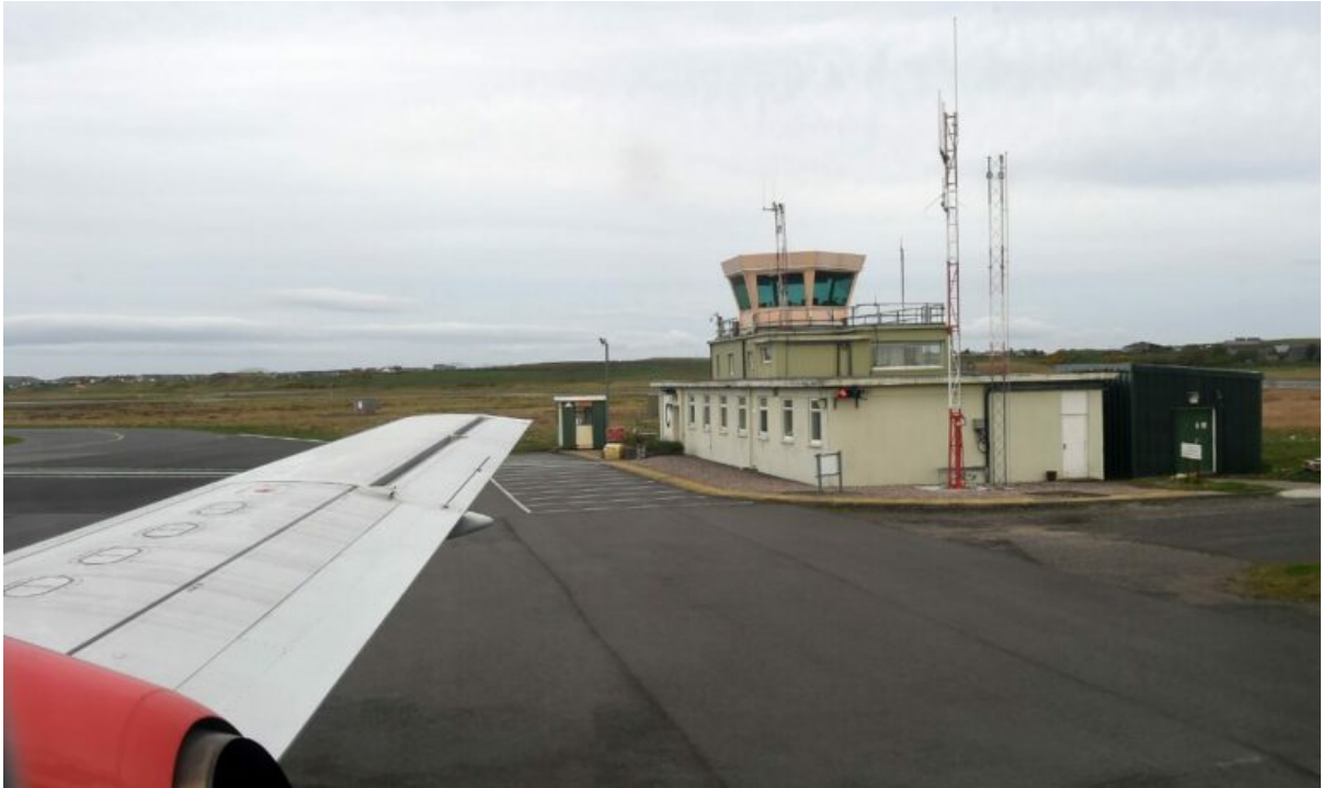
Air traffic to islands such as Lewis could be disrupted.

A HIAL spokesman noted its local teams are “working closely with emergency partners and our airlines” in a bid to minimise disruption.