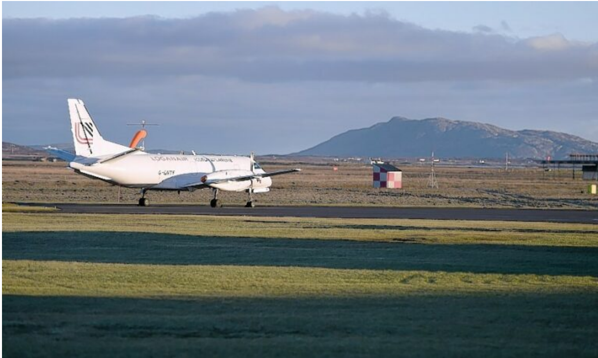
Overtime ban adds to HIAL woes.