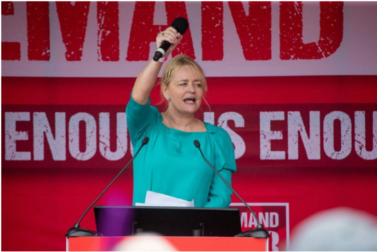
Unite general secretary Sharon Graham.

Unite says the Scottish Government to date has not directly met the union to discuss pay, recruitment and retention of workers across the HIAL group.