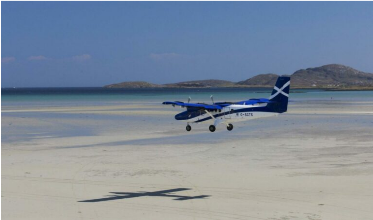
Strike could affect operations at Barra’s famous beach airport.

Kirkwall Airport will operate on a limited basis, opening between 07.15 and 13.00 on February 21, 22 and 23 for inter-island flights only.